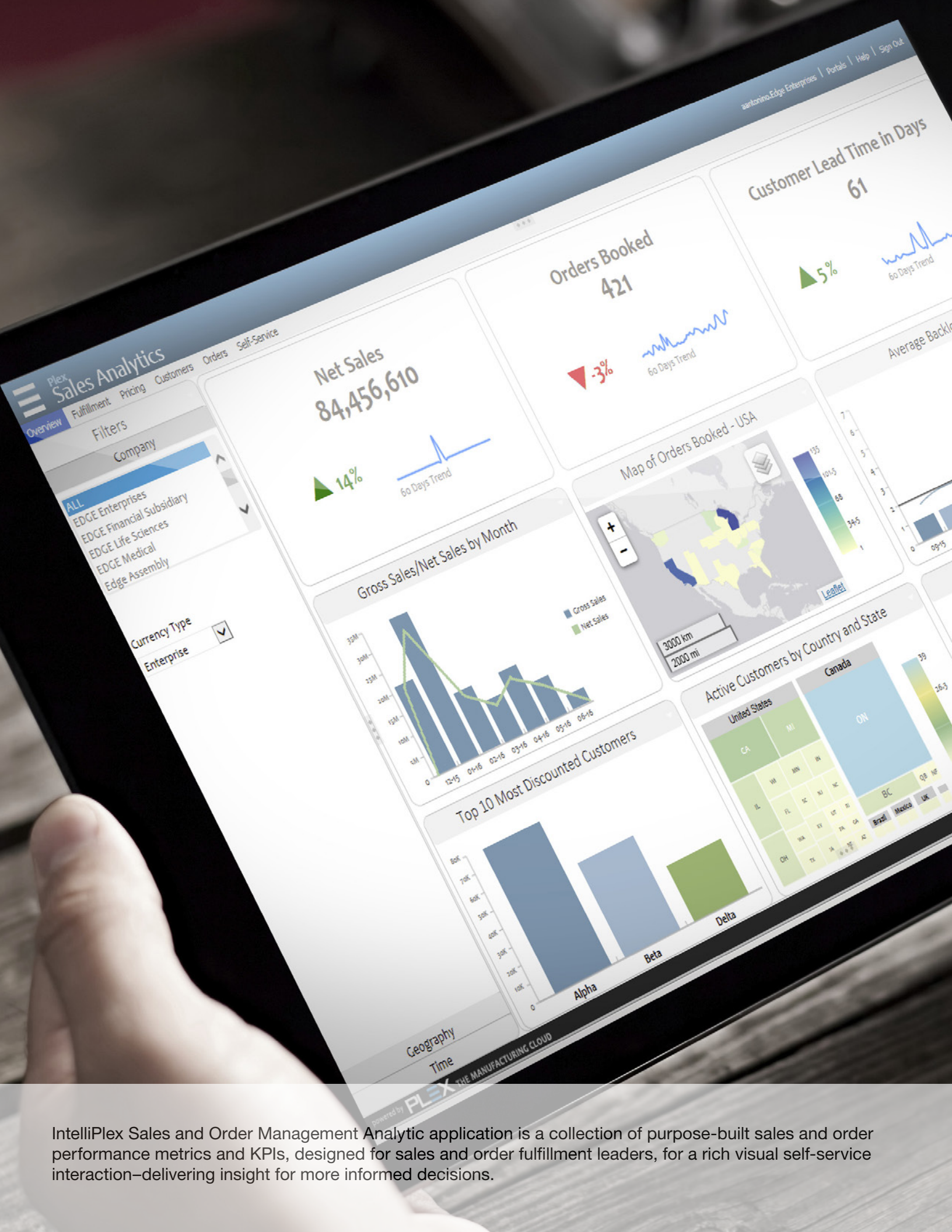
IntelliPlex Sales and Order Management Analytic application is a collection of purpose-built sales and order performance metrics and KPIs, designed for sales and order fulfillment leaders, for a rich visual self-service interaction—delivering insight for more informed decisions.